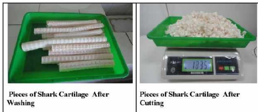
Fig 2. Fresh Shark Cartilage

The shark cartilage and its flour yield are presented in Fig. 2 and Table 1. The cartilage is white-yellowish, and mean yield produced is 18.39%. Previous finding found that glucosamine isolated from shark cartilage had nearly similar functional group to the commercially supplement and based on the functional group, the glucosamine belonged to glucosamine sulphate. [10]